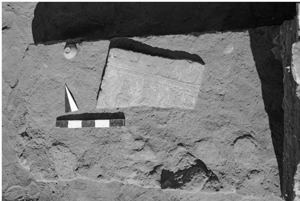
1–2. Decoration fragment from a sacral building on Elephantine under excavation.