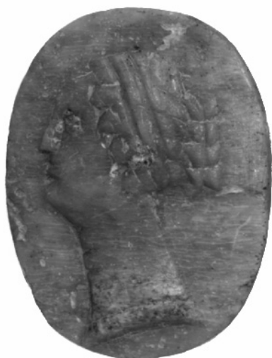
5. Bezel of the bone finger-ring inv. 17/XII/08, enlarged 3x.