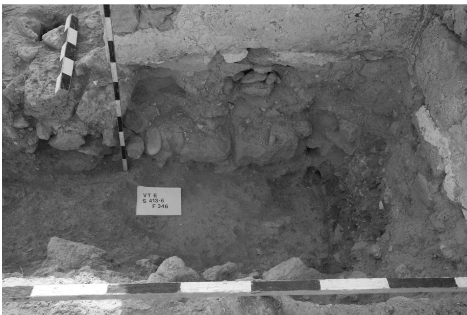
3. Eastern section of trench 416 with discontinuous foundation of eastern wall of room 82 (Phot. H. Meyza).