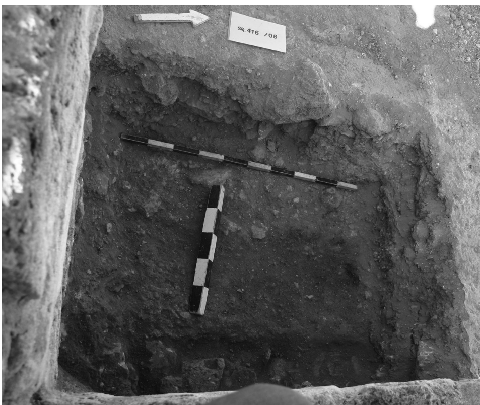
4. Bottom of stratum with burnt matter, place of find of the bone finger-ring (Phot. H. Meyza).