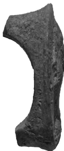
6. Bone finger-ring inv. 17/XII/08, side view.

Until clear traces of use as a street have not been uncovered on larger area, this interpretation cannot be treated as confirmed.